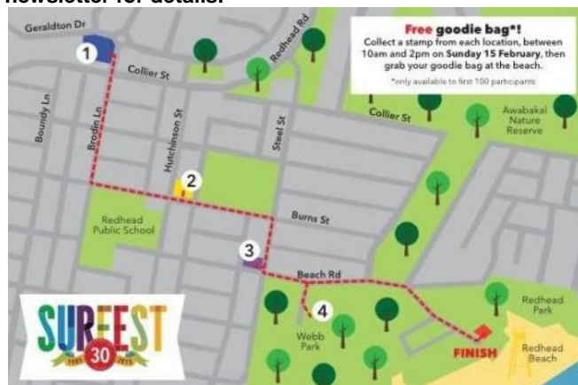
Surfest Community Trail, Redhead 15 February

From 10 am on Sunday 15 Feb, the Community Trail will feature: the Redhead Men's Shed, the Library, the Guide Hall and Webb Park. Get a stamp at each venue and claim a prize at the beach*. At each location there will be activities and displays by Redhead community groups. See the coloured Festival of Surfing flyer delivered with this newsletter for details.