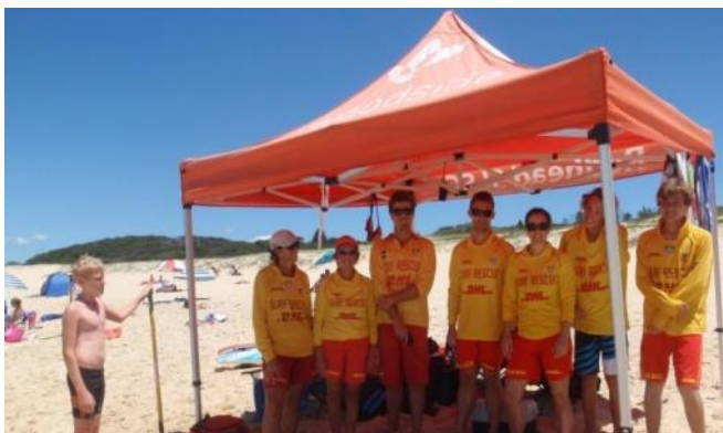
Redhead SLSC On Patrol

Started in 1908, the Surf Club is one of the longest running and most valued community organisation in Redhead. It has a total of 700 members drawn from Redhead and surrounding suburbs and includes one of the largest surf Nipper groups at 400 members, plus 160 active lifesavers. It is this group who take part in competition and who you see on surf patrol during weekends and public holidays.