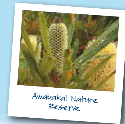
Awabakal Nature Reserve

Join some great community projects – we want to hear from you.