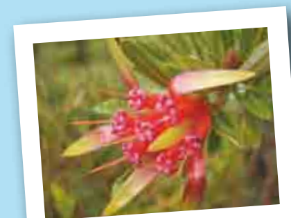
Mountain Devil Lambertia

Work with relevant authorities and landholders to improve bushfire management practices, and improve community preparedness.