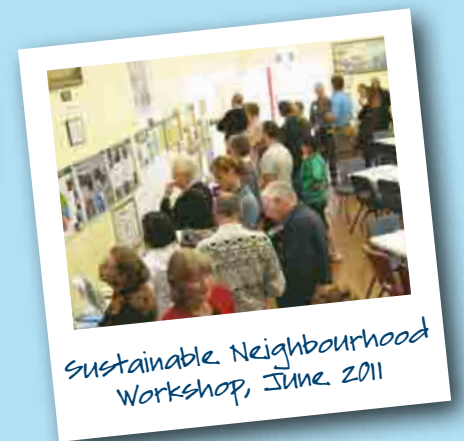
Sustainable Neighbourhood Workshop, June 2011