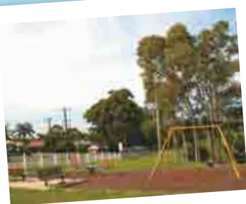
Frank Watkins Memorial Park