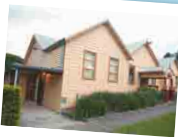
Dudley Senior Citizens Hall

Create a multipurpose outdoor activity centre in Dudley to provide a place for young people and families to enjoy.