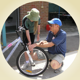
All generations have a voice and are actively involved in the community