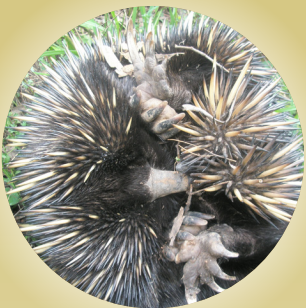
Our natural bushland areas and waterways are healthy and teeming with native flora and fauna, and are cared for and enjoyed by local residents