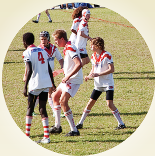
Our local facilities are valued and benefit a wide spectrum of the community