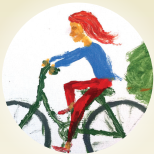
Places of interest are accessible and people feel safe walking and cycling