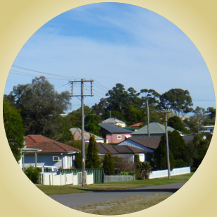
Our streets are clean, beautiful and showcase our people and heritage