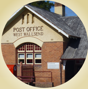
Local businesses are thriving and they are valued by residents and they support the local community