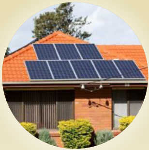
Our homes and lifestyles only leave a small footprint on the environment