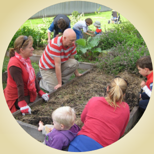
Our community gets together regularly to share ideas and skills