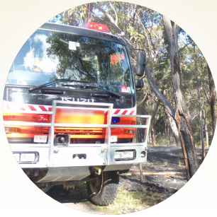
Our community supports each other and is resilient in the face of neighbourhood challenges

Our community enjoys healthy and beautiful natural areas, first grade community and recreational facilities as well as active citizenship across all generations. We look forward to a prosperous future, while celebrating our rich heritage and retaining the village feel and country atmosphere.