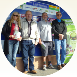
Our people are proud of the neighbourhood and welcome visitors to enjoy the peaceful outlook, village feel and friendly faces