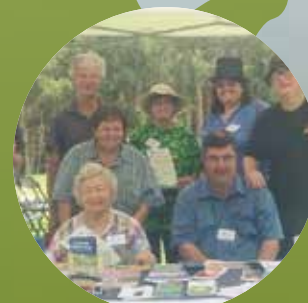
Morisset and Peninsula