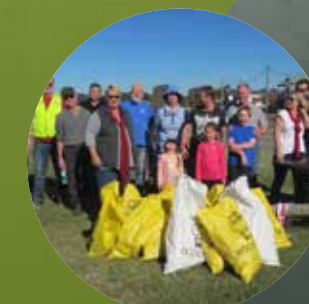
Caves Beach-Swansea Area