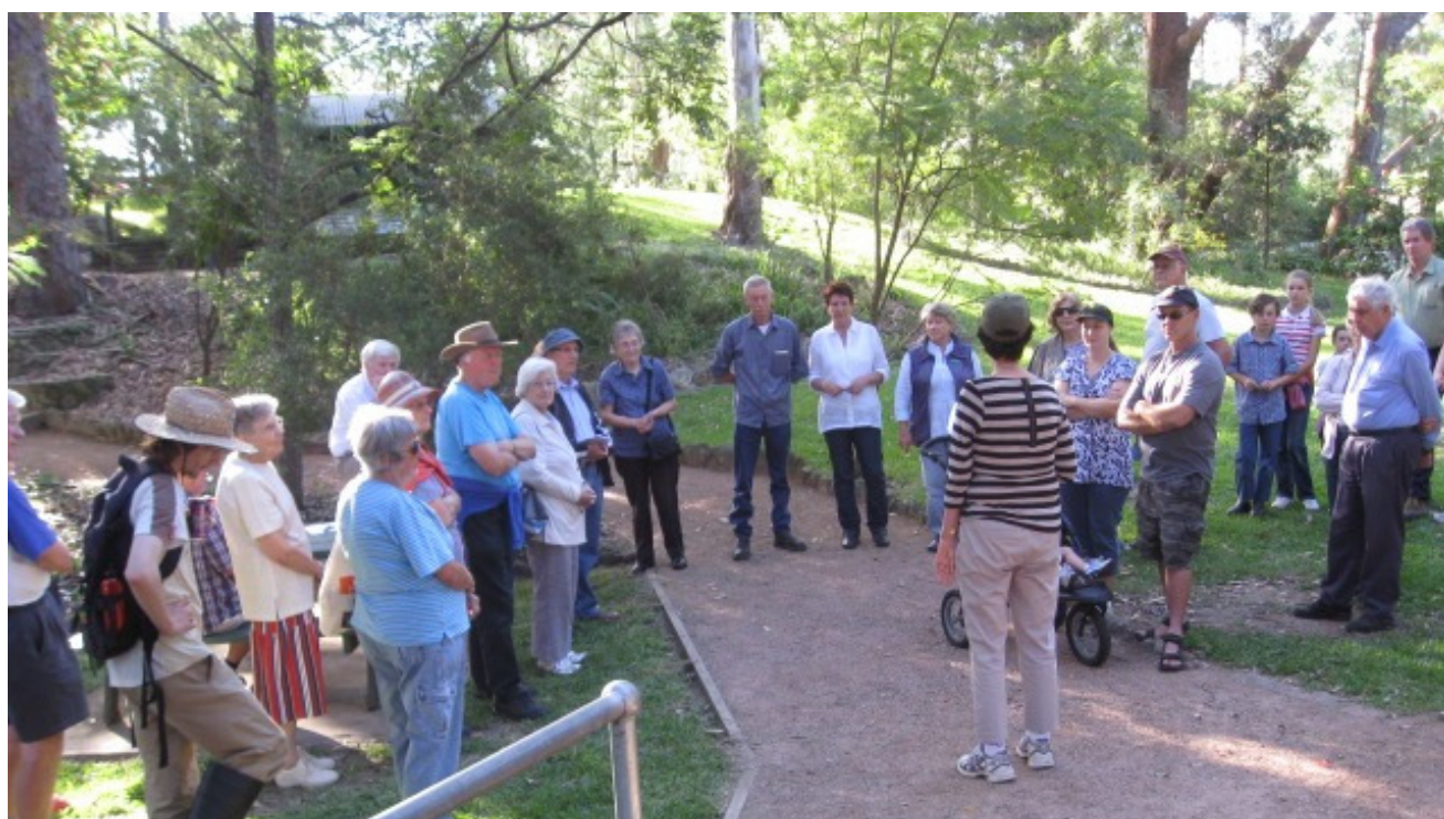
'A Walk in the Park' Field Trip