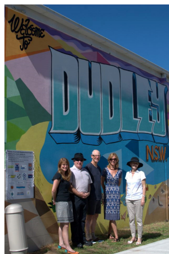
Launch of the Dudley Mural in March 2013