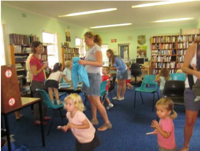
Kids enjoy Story Time at Redhead Community Library

"Story Time" happens on the first Friday of each month at 10:30 am. It is for 0-5year olds but it is also a great way for mums with children who may not have started school yet, to meet and get to know others in the area. Some of the mums have moved to Redhead recently and these times together can make settling into a new place a lot easier. Story Time is run by the ever enthusiastic Library Committee.