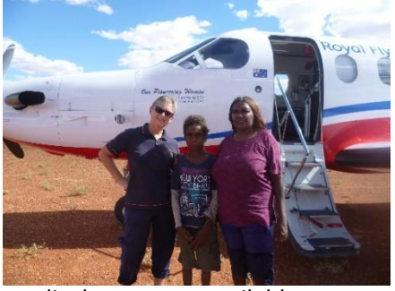
medical resources available.

Any problems and we call the duty Remote Medical Practitioner for advice on treatment. The sickest patients are sent out by Royal Flying Doctor Service or Careflight, depending on where you are in the NT. The clinic provides 24/7 emergency service to deal with any after-hours medical problems, so nurses are frequently on call. The RFDS are our angels. From experience, there is nothing better than watching the plane take off up the air strip with your sick patient aboard knowing that you have done your best, but they are going to a better place (Alice Springs, Darwin), where there are a lot more