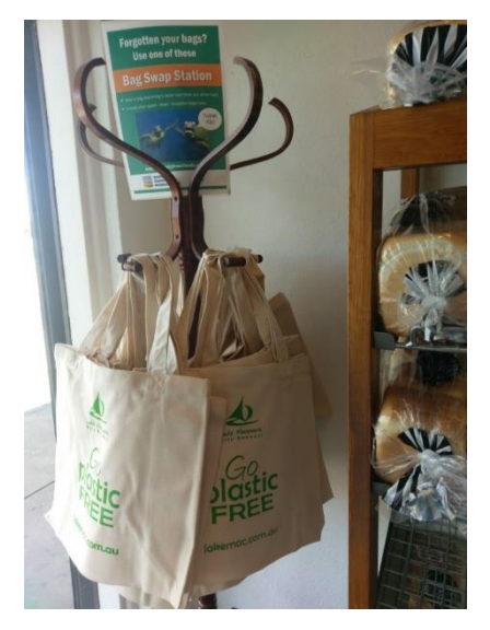
Bag swap station at Redhead Bakehouse

If you have heaps of reusable bags sitting at home unused why not take some down to your local shops and give others the opportunity to save on plastic?