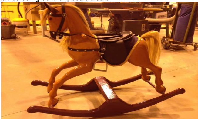
Restored rocking horse

"So with all this capability, we have undertaken a number of projects such as refurbishing a rocking horse, making a lot of wooden toys for resettled families and their children, restored a dolls' house, built a number of bird and possum nesting boxes, refurbished the local pre-school outdoor furniture, and provided an access ramp for a local sponsor. Lately there have been a couple of wooden folding tables being built for possible sale."