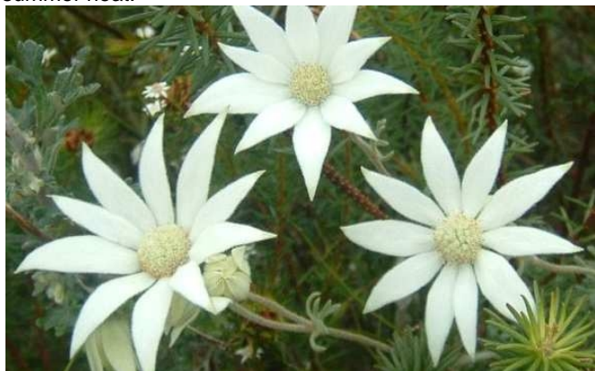
Flannel Flowers in the Awabakal

Flannel flowers are in bloom in the Awabakal Nature Reserve heralding the return migration of Humpback and Southern Right whales with calves to their Antarctic feeding grounds. This year's mass flowering of plants in the Awabakal has been spectacular after last year's fires and will finish in its major flush by the end of October in time for the summer heat.