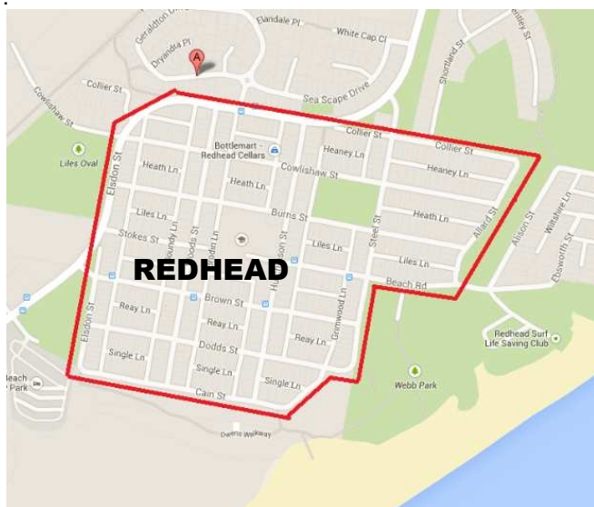
All houses inside the heavy line can be served by gas