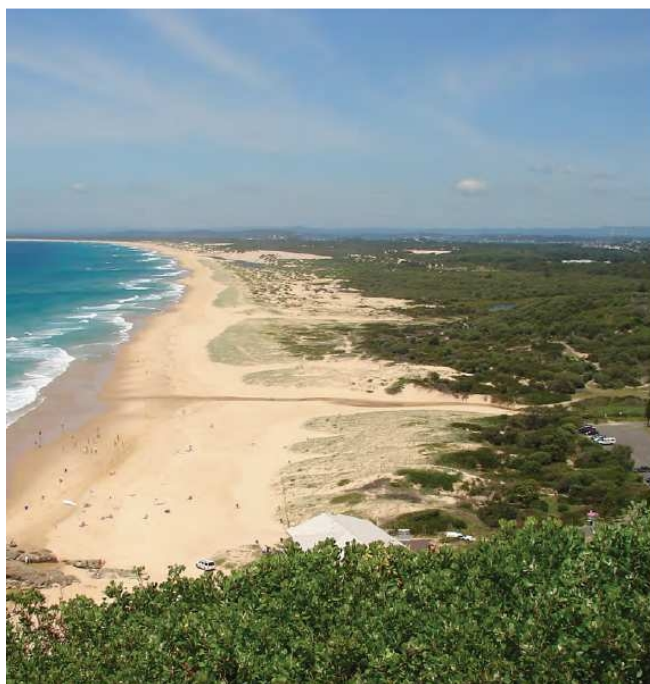
Beach and Belmont Wetlands Park from Redhead Bluff

It was explained that each of these areas includes internationally protected wetlands and habitat for migratory birds. As well, there is a proposal for a combined Coastal Wetlands Park with potential international significance which would include the Awabakal, Jewells Wetlands and Belmont Wetlands Park, with a total area of 1730 ha.