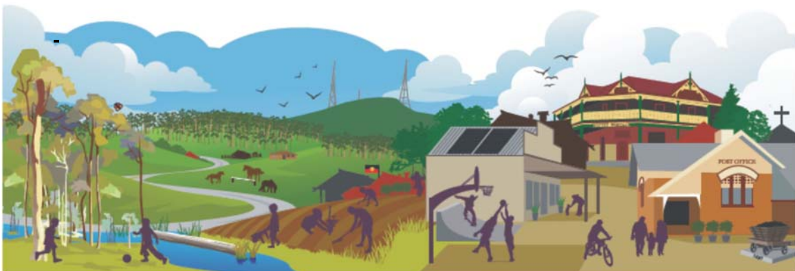
WEST WALLSEND - HOLMESVILLE - SEAHAMPTON - BARNSELY - KILLINGWORTH - O'DONNELLTOWN