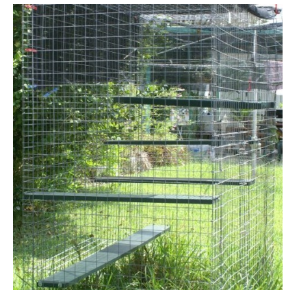
Outdoor cat enclosure