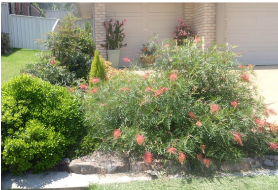
Native habitat can provide refuge for wildlife